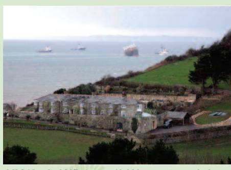
MSC Napoli, 2007. At over 60,000 tonnes it was the largest vessel to be stranded on this coastline