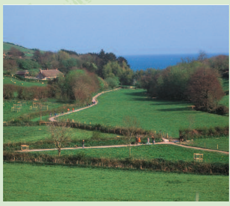
All ability footpaths down to Branscombe Mouth