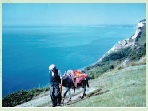
'Cliffy Gosling', the last of the Branscombe cliff farmers cicra 1960 (8 Sweetland collection)

See www.devon.gov.uk/transport/public_rights_of_way for gradient information on all Rights of Way.