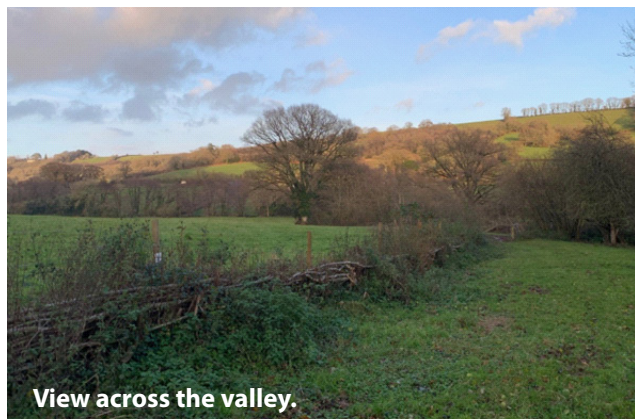
View across the valley.