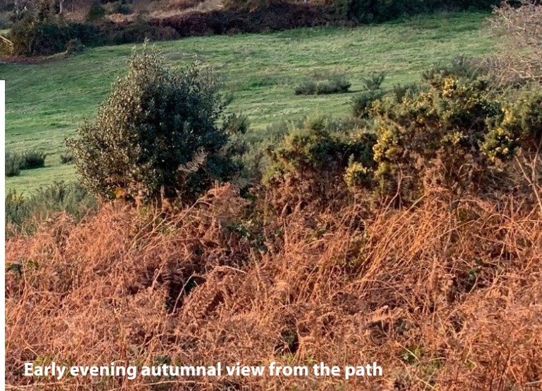
Early evening autumnal view from the path

Historic structures and features are conserved, enhanced, or interpreted more effectively.